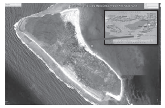
Fig. 1. Ana Dara Marine Waters Rote Ndao (10°49′S – 122°40′E)

This research was carried out in the intertidal zone of Dara Mara Beach in Ndao Nuse District, Rote Ndao District.